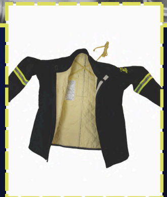
Gas Extraction Suits

Don't wait for the emergency – build-in your rescue plan. Choose Oberon. Choose smarter safety.